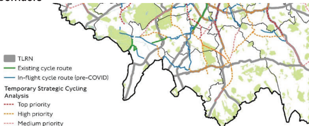
Figure 1 Image from TfL's Temporary Strategic Cycling Analysis Priority Corridors

The Strategic Neighbourhood Analysis 20 identified the potential for low traffic neighbourhoods across London, and where the greatest need may be. The Analysis allocates 'neighbourhoods' two scores, a traffic filtering score and a general score. These are combined in Figure 2 below. The traffic filtering score is based on: